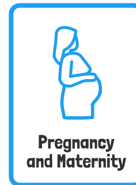
Pregnancy and Maternity