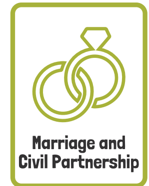
Marriage and Civil Partnership