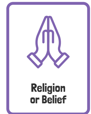
Religion or Belief